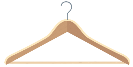
Possible use: measuring device