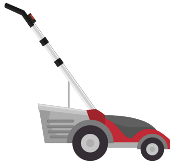
Possible use: transportation device