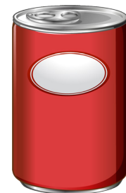
Possible use: household decoration