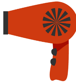
Possible use: weapon