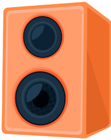
Possible use: religious object