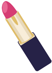
Possible use: writing implement