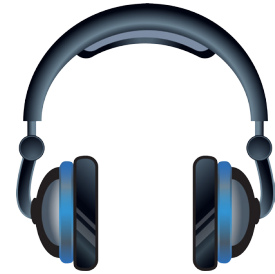
Possible use: medical device