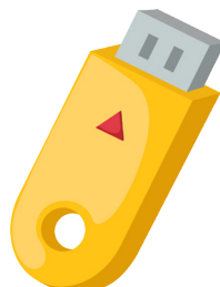
Possible use: jewellery