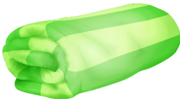
Possible use: clothing